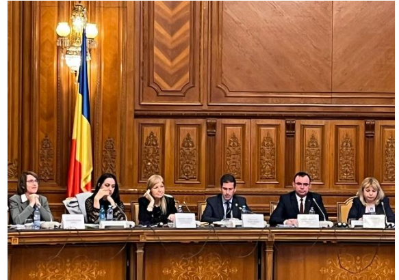
On 14 November, UNHCR, together with the Ministry of Interior, and JRS organised a roundtable on statelessness at the Parliament in Bucharest.

On 14 November, UNHCR, the Ministry of Interior, and the Jesuit Refugee Service hosted a roundtable on statelessness in Bucharest to discuss steps to advance towards the completion of the statelessness framework in Romania. The event brought together some 40 participants including the President of the Senate committee on Human Rights, and State Secretaries of the Ministries of Interior and Justice, along with officials from other relevant government institutions, civil society, UN agencies, statelessness experts, and associations of magistrates and lawyers. The participants addressed common challenges and sought ways to complete the existing framework, ensuring improved protection of stateless persons and everyone's right to a nationality. In the opening remarks the UNHCR Representative said that "Romania's capacity to protect and address complex situations ought to benefit stateless persons, as remaining challenges are addressed". Additional information about statelessness and the event is available here .