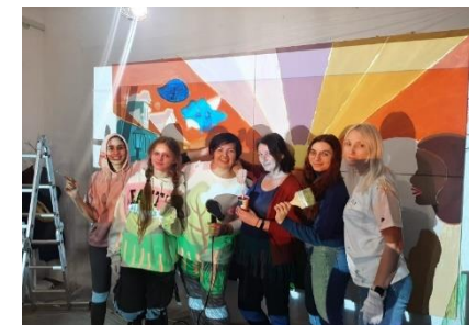
Panel at the community art event organised in Timisoara by UNHCR together with AidRom and supported by Artolution.

Last week, over 50 participants attended a community art event involving young Ukrainian, Syrian and Afghan refugees, as well as Romanian citizens in Timișoara. The event was organised by UNHCR together with AidRom and supported by Artolution, and provided a collaborative art-making experience to participants in vulnerable communities, strengthening their wellbeing and social inclusion.