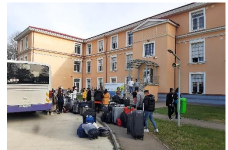
UNHCR together with IOM and AidRom supported the arrival of 88 Syrian and Afghan refugees who arrived at the Emergency Transit Centre (ETC) in Timisoara from Türkiye for further resettlement to a third country.

This week, UNHCR in coordination with authorities and partners received a group of 88 refugees to the Emergency Transit Centre (ETC) in Timisoara. The group will be hosted at the centre until resettlement procedures will be completed to allow them to depart from Romania to a third country. So far refugees participated in a welcoming community meeting held by UNHCR, in collaboration with the General Inspectorate for Immigration (GII) and AIDRom. So far this year, some 248 refugees from various countries have been assisted at the ETC in Timisoara.