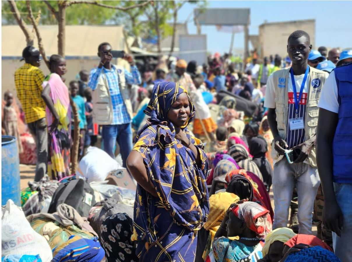
UNHCR and partners at the Renk transit centre earlier this week during a donor mission.