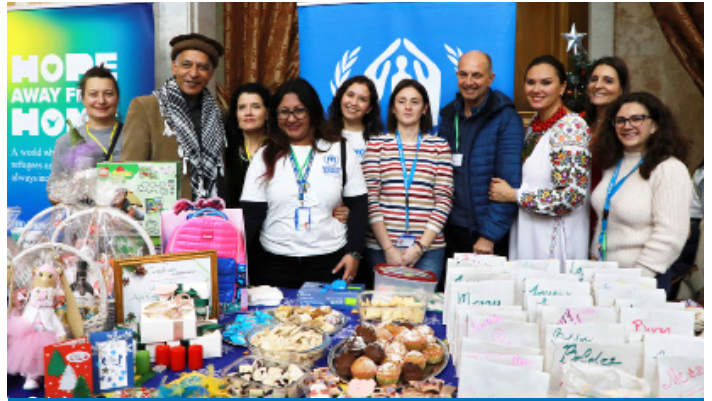
International Charity Bazaar, Chisinau.

On 11 and 25 November, two evacuation flights of Ukrainians and Moldovans arrived to Moldova from Gaza. UNHCR provided assistance to around 85 refugees, which were mostly women and children. UNHCR is monitoring closely the situation of those who have remained in Moldova and provides legal support to them.