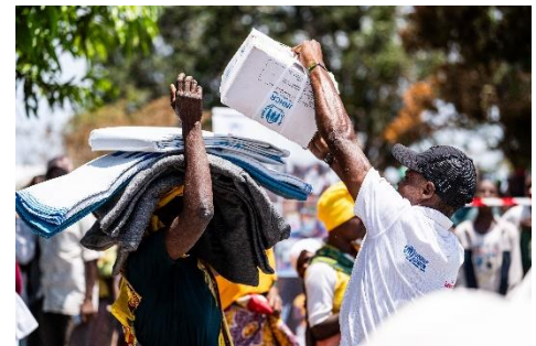
UNHCR and partner Helpcode distribute core relief items to 500 IDP families who fled from recent attacks in Mocimboa da Praia district.