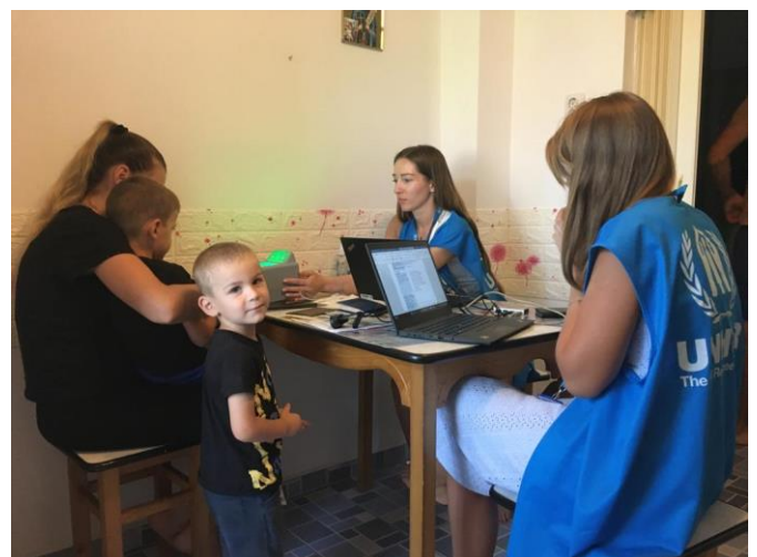
5 enrolment centres in Bucharest, Brașov, Galați, Suceava and Iași. Mobile enrolment teams across Romania.

Cash Assistance: UNHCR's cash assistance programmes are designed in coordination with the Government to complement its efforts to support the refugees from Ukraine. They serve as a transitional safety-net pending the individual's ability to secure employment or be included in national social protection schemes. In 2023, UNHCR's cash assistance has evolved towards more tailored interventions to the most vulnerable refugee population, progressively focusing on a cash for protection programme whose beneficiaries are selected based on a vulnerability scorecard jointly developed by 17 organisations under UNHCR's coordination, which in turn enables partners to assess vulnerability in similar and compatible ways. Deduplication with other cash assistance providers - notably the Romanian Red Cross - is ensured and organisations providing this assistance have agreed on similar transfer values and complementary modalities through the Cash Working Group. In