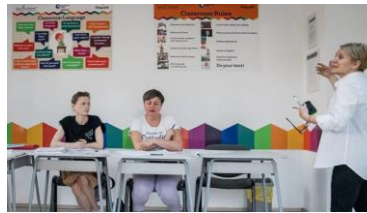
How Romanians view refugees