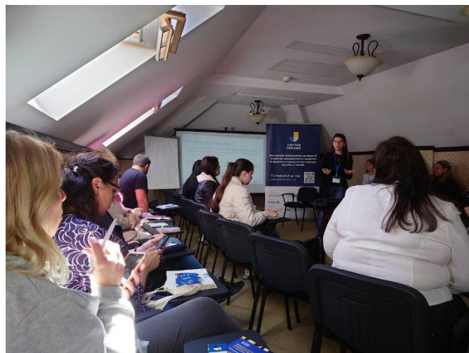
Refugees attend a CV-writing workshop facilitated by Jobs 4Ukraine, Constanţa.