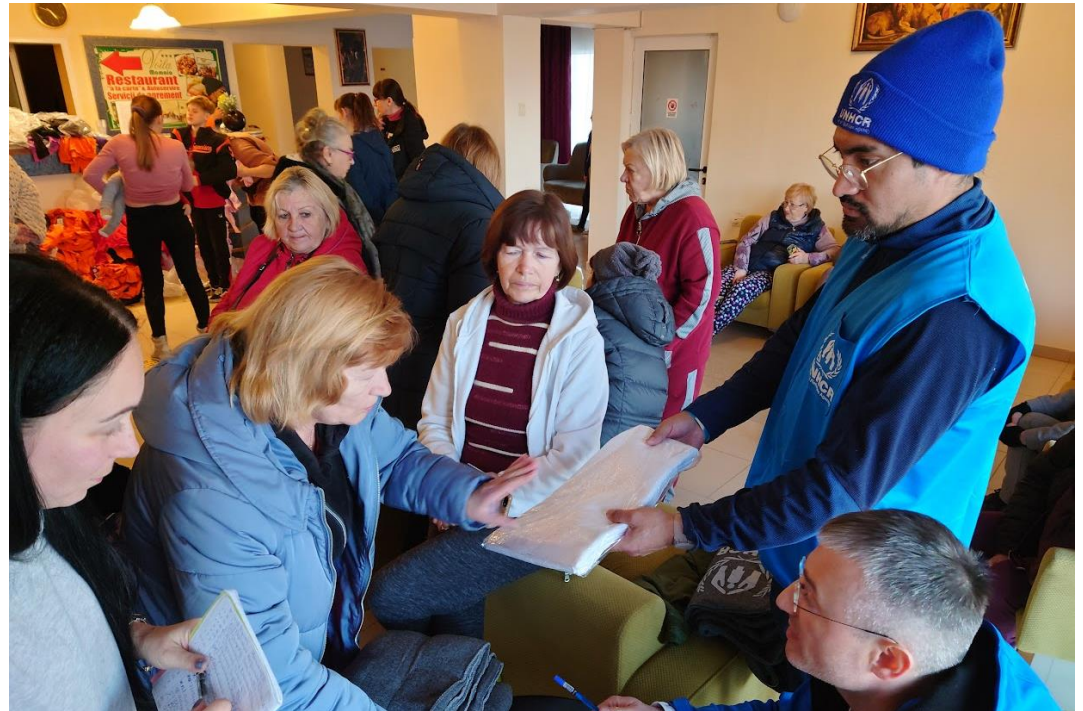
Refugees receiving UNHCR core-relief items in in Constanța.

6,672 refugees reached through employment website, livelihoods counselling and Romanian language courses