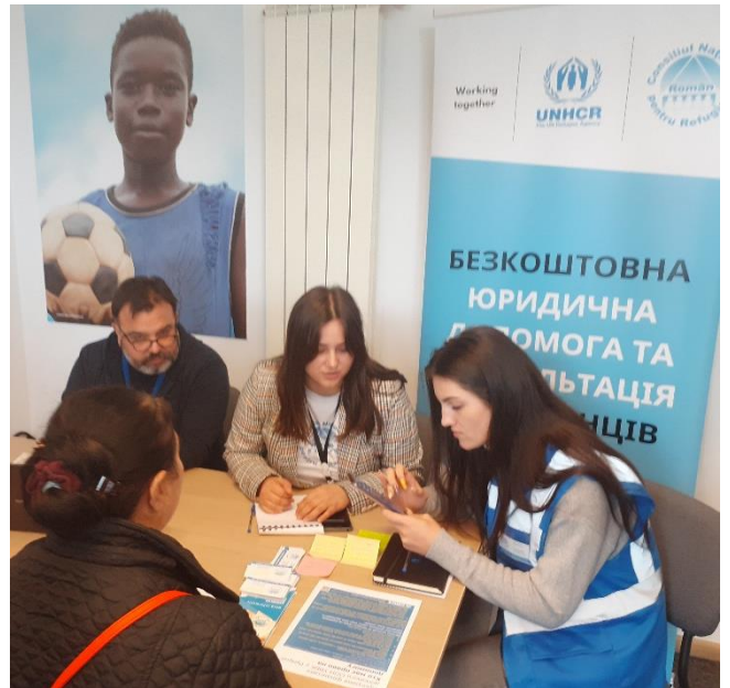
A refugee receives protection counselling from UNHCR partner CNRR at the Service Hub in Galați.

UNHCR leads the Inter-Agency Protection Working Group to help 37 organisations coordinate their protection response and avoid duplication of effort. UNHCR, together with partners Terre Des Hommes and Autism Voices, work in Brașov, Bucharest, Constanța, Galați, Iași, and Suceava, to support children with specific needs, establish child-friendly spaces, ensure psychosocial support, raise awareness, and enhance capacity of the authorities, partner staff, and volunteers. UNHCR, jointly with UNICEF and partners, also advocated on access to education for refugee children from Ukraine to ensure that no child is left behind and - through some child protection interventions - complemented the response from UNICEF and other partners in education.