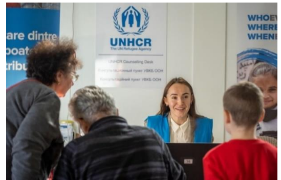
Refugees from Ukraine accessing services at UNHCR's integrated service hub at RomExpo, Bucharest.