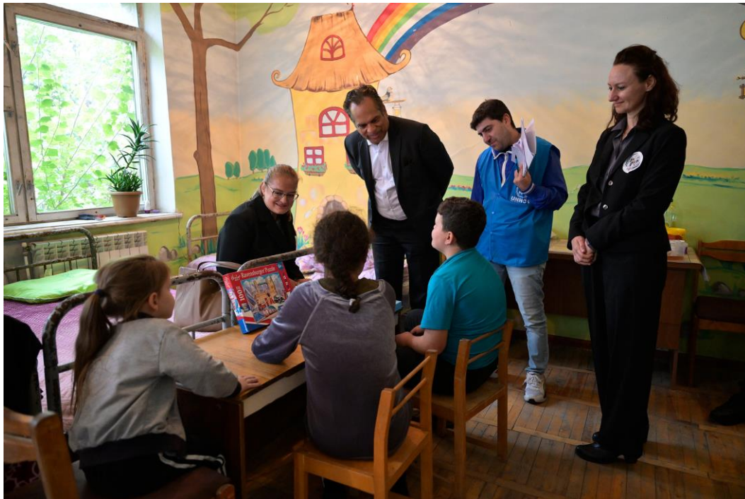
Community-based protection staff conducting a site visit.