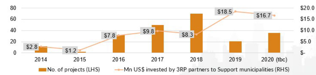
Graph 1: Value of Support – Number of Projects

To increase effectiveness of provided support, avoid overlaps of assistance and advocate for mobilization of further funding; inter-agency coordination is invested in enhancing the coordination of municipal support by partners. Basic Needs sector identified the increasing need of information around the support that went to municipalities from partners in an expanded meeting with participation of partners across sectors in December 2020. To address this need, action point was set to update the “municipal mapping” which captured over 200 projects by 3RP partners across sectors between 2014 – 2019 March. The second round of mapping aimed to include mapping of support to municipalities by IFIs, considering their large contribution to development of infrastructure and facilities.