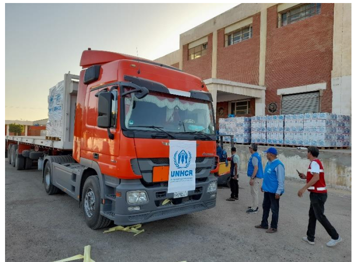
UNHCR Egypt is delivering humanitarian aid to Gaza through its partnership with the Egyptian Red Crescent.

UNHCR requires USD 134.7 million to support refugees and host communities in Egypt in 2024. As of 31 January, only 10% of its funding needs were met. UNHCR is grateful for the critical support provided by public and private donors.