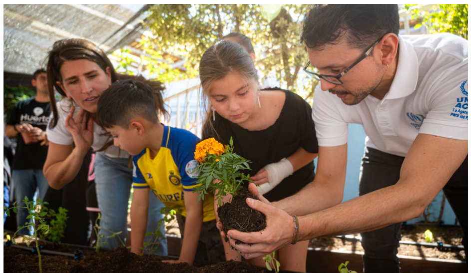
Through the "Close the Loop" project, UNHCR is promoting environmental sustainability by reducing the impact on the carbon footprint while implementing its activities in Chile. During the closure of the project, a community garden was remodeled to promote peaceful coexistence among neighborhood residents of La Pintana.

1 Field Presence in Iquique (Tarapacá Region)