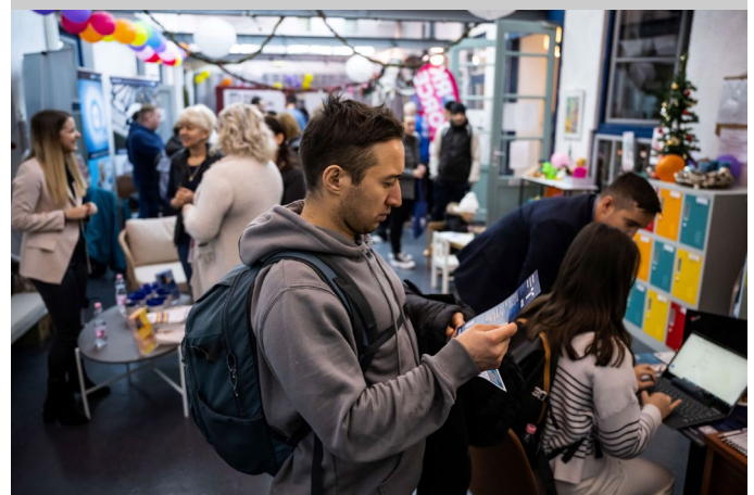
Márton Mónus © IOM Hungary

The RCF published five advocacy and briefing notes that address the needs of the most vulnerable refugees to support their inclusion throughout 2023.