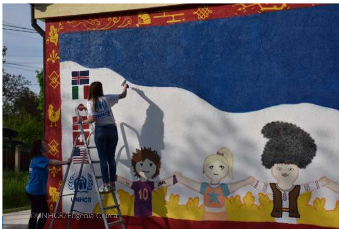
Refugees and Moldovans, young artists of the "Urban Spirit Family" NGO, a global non-profit organization Artolution, along with UNHCR staff realized the mural at the Community Service Centre in Donduseni, as a symbol of solidarity and peace.

UNHCR has entered the second phase of its targeting exercise for Ukrainian refugees residing in Moldova who are currently receiving cash assistance. The updated criteria involve assessing various factors that indicate refugee's degree of vulnerability, and continued eligibility for cash assistance. Through this process, UNHCR will prioritize the most vulnerable families based on available resources. This adjustment aims to ensure support reaches those refugees who are most in need.