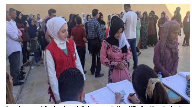
Legal support for issuing civil documentation/IDs for the students. coming from neighbouring countries to sit for national exams.

In coordination with the Ministry of Education, and the Directorate of Civil Affairs, 4,942 students were assisted to apply for and obtain their IDs.