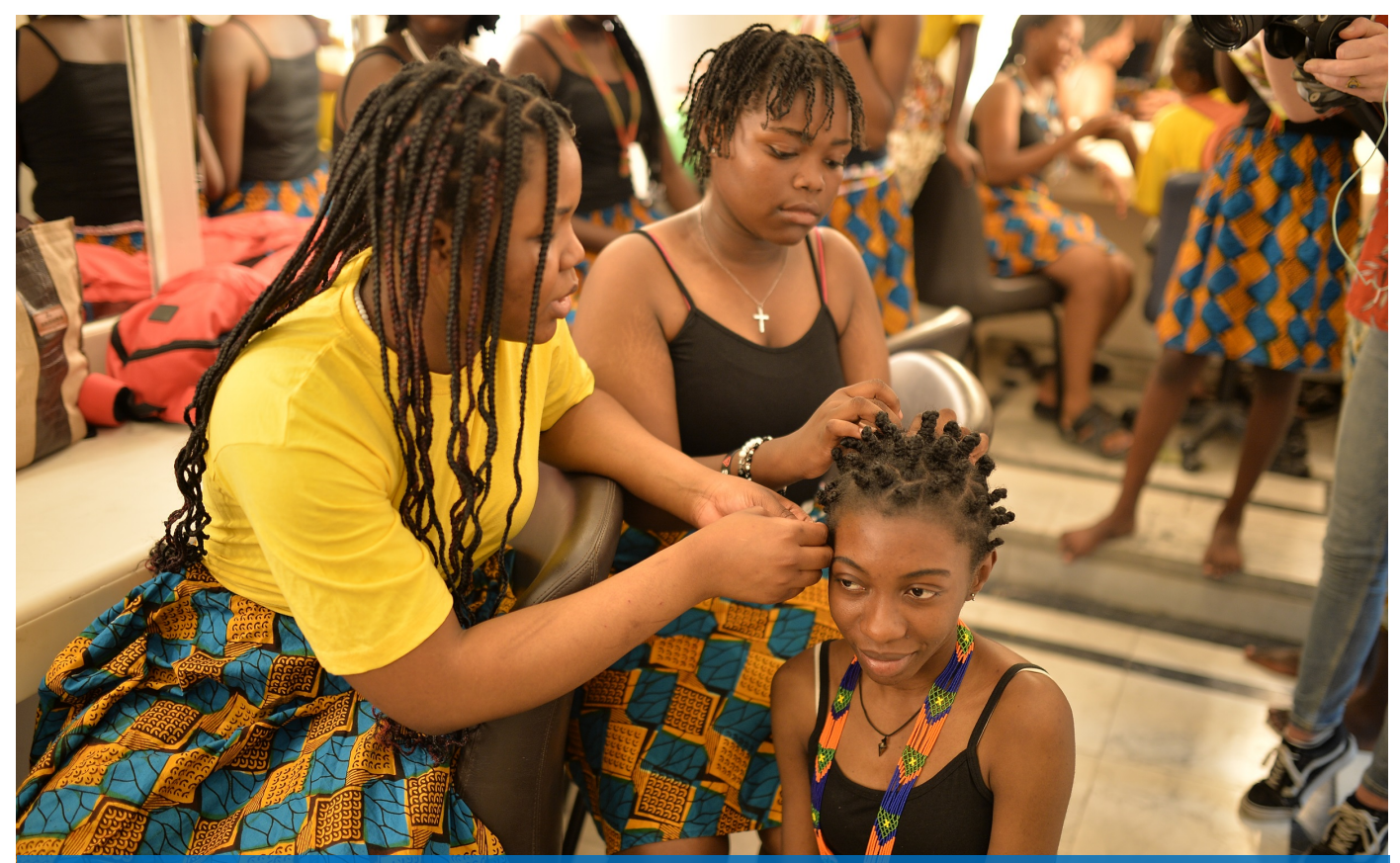
Dancers from the South Sudanese group Sons of Farateet get ready to go on stage for their performance during the UNHCR's World Refugee Day event at the American University in Cairo on 12 June.