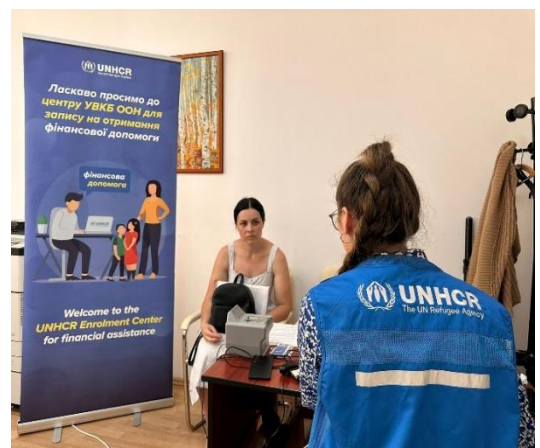
Mobile mission to enrol vulnerable refugees for cash assistance programme in Baia Mare,

UNHCR is grateful to the donors of unearmarked and softly earmarked contributions to the Ukraine situation. UNHCR in Romania is also grateful to donors contributing to its 2023 and 2024 programmes. For more details: Romania Funding Update - 2024 | Global Focus (unhcr.org)