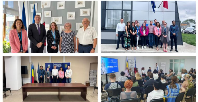
23-26 July 2024, series of consultations with the local authorities in Iasi and Suceava.

From 23 to 26 July, senior officials from UNHCR in Bucharest visited Iasi and Suceava and consulted with the Prefecture, County Council, the national authorities for Social Protection, and the Department of Emergency Situations. During the visit, the team also met with the national NGO partner, the Romanian National Council for Refugees (CNRR), engaged in border monitoring.