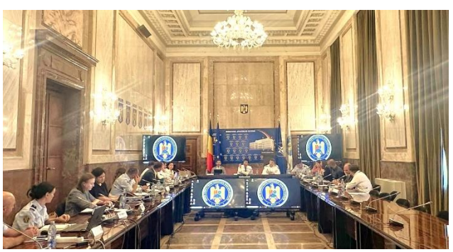
30 July, a working meeting at the headquarters of the Ministry of Internal Affairs on preparedness capacity and contingency planning.

From 30 July to 31 July, a delegation from the Ministry of Internal Affairs of the Republic of Moldova. consistina of Senior Officials from the Inspectorate General for Migration, Border Police. Inspectorate General for Emergency Situation, and Inspectorate for Operational Management visited Bucharest accompanied by a UNHCR Moldova team and met with the Government of Romania