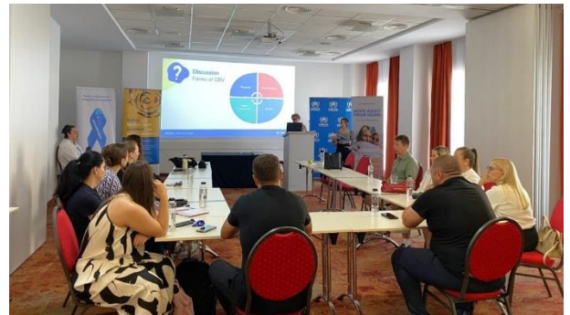
14 August - GBV Training in Constanta, Romania.

On 14 August, UNHCR and partner Sensiblu Foundation facilitated a training session on the safe disclosure of gender-based violence (GBV) incidents in Constanta. There were 13 focal points from various humanitarian organizations, including CRC, WV, JRS, Life for Ukraine, RO-UA Novapolis, and CNRR. So far in 2024, UNHCR and partners have