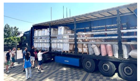
20 August, the truck with CRIs stocks.

Last week, UNHCR in Suceava restocked seven tons of core relief items (CRIs) for Ukrainian refugees. UNHCR and partners in Radauti delivered CRI to 211 refugees in 74 households. The items distributed included hygiene items, mattresses, sleeping bags, kitchen utensils, bed linen, and women's clothing. The remaining CRIs will be distributed to vulnerable refugees in the coming days. In 2024, UNHCR has distributed over 63,000 CRIs to nearly 34,500 refugees from Ukraine.