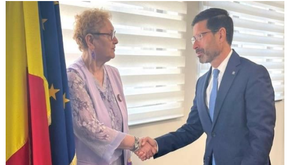
20 August, meeting between UNHCR Representative and the People's Ombudsperson.