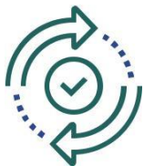
Updates & Achievements

Members to consider 2025 thematic goal of the TWG towards ensuring advocacy on legalizing and regulating the professions in mental health.