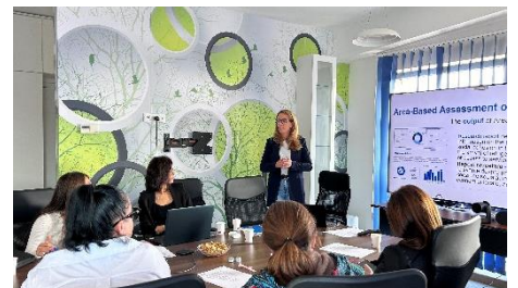
Training on the methodology of the Area-Based Assessment.

UNHCR is grateful to the donors for unearmarked and softly earmarked contributions to the Ukraine situation. UNHCR in Romania is also grateful to donors contributing to its 2023 and 2024 programmes. For more details: Romania Funding Update – 2024 .