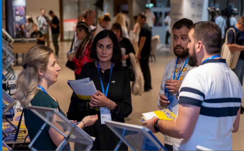
On 27 and 28 August 2024, the All-Ukrainian Forum of IDP Councils took place in Kyiv. This is the second time this national forum was convened in partnership between SSS, UNHCR and IREX under the auspices of the Ministry of Reintegration of the Temporarily Occupied Territories. © Ievhen Vorontsov, August 2024.