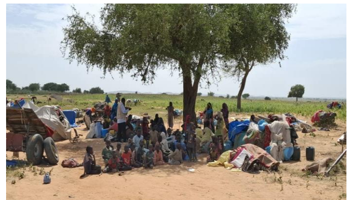
Sudanese new arrivals in Birak, Wadi Fira Province