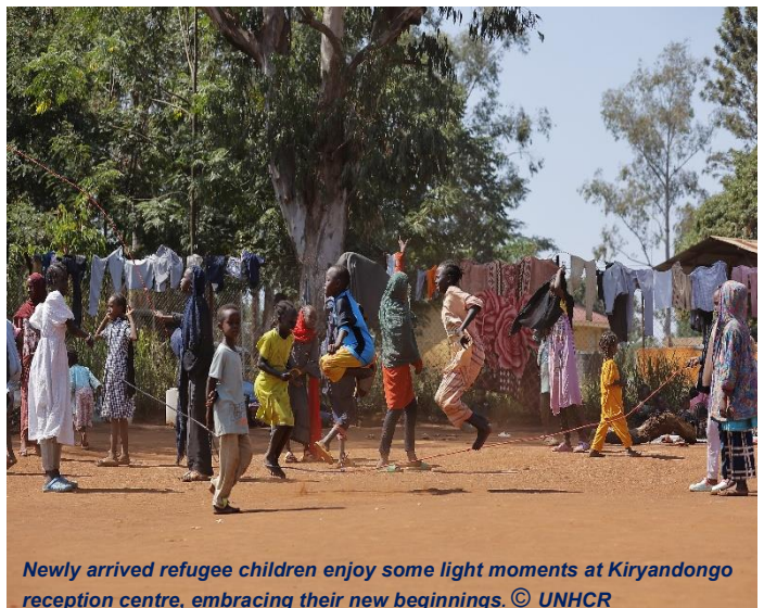
Newly arrived refugee children enjoy some light moments at Kiryandongo reception centre, embracing their new beginnings.

The humanitarian situation in Uganda is still deeply troubling for the more than 1.7 million refugees, asylum seekers, and their host communities. Even with ongoing underfunding of the refugee response, there has been an unprecedented surge in Sudanese and urban new arrivals this year. Uganda's progressive refugee policies, allow refugees to live in settlements rather than camps, granting them freedom of movement, and the right to work. Despite these policies, the refugee population faces significant challenges. There are ongoing needs in areas such as healthcare, education, water, sanitation, and protection for a largely youthful refugee population. The influx of new arrivals continues to strain resources, and there is an urgent need for additional funding to support these efforts.