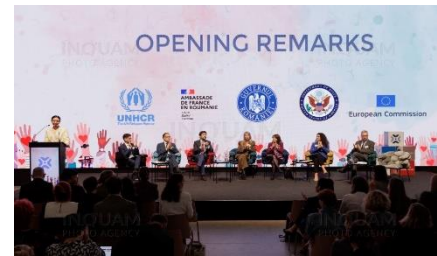
Donor Meetup Event, organised in Bucharest, 18 October

On 18 October 2024, the Inter-Agency Coordination Platform led by UNHCR organized a Donor Meetup Event in Bucharest to support organisations part of the refugee response plan (RRP) in their work with the Romanian host communities that welcome refugees, and with refugees from Ukraine. The event took place under the auspices of the Chancellery of the Prime Minister and was co-hosted by the Embassy of the United States of America, the Embassy of France, and the European Commission Representation in Romania. Over 120 participants from the government, embassies, international organisations, private sector, and civil society attended the event. Following remarks made by Romanian authorities and Ambassadors, as well as by UNHCR Representative, the event continued with a networking session - in a marketplace format - where over 29 RRP partners had the opportunity to exchange their priorities for host communities and refugees with Embassies and private sector.