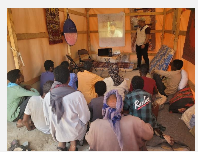
Acted CFM Awarness in Al-Ada'en Site, Ad Dali