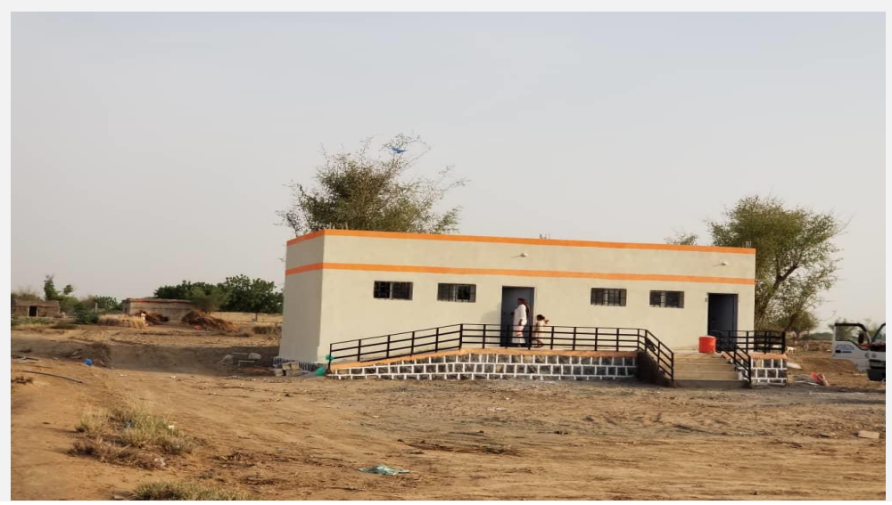
JAAHD The construction of two classrooms in Mehsam Mubara, Al Hodeidah