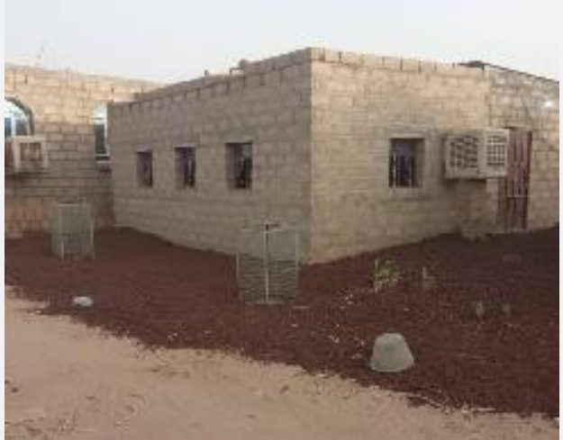
Community Led-Projects Acted in Marib