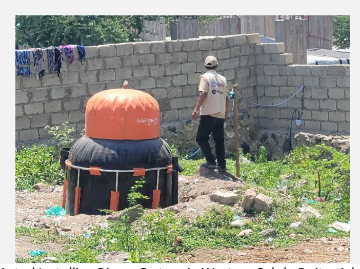
Acted Installing Biogas System in Western Sahda B site, Ad-Dali