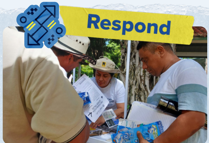
In Puerto El Triunfo (Usulután department) the mobile unit of UNHCR's Support Space "By Your Side" delivered information on rights and services.