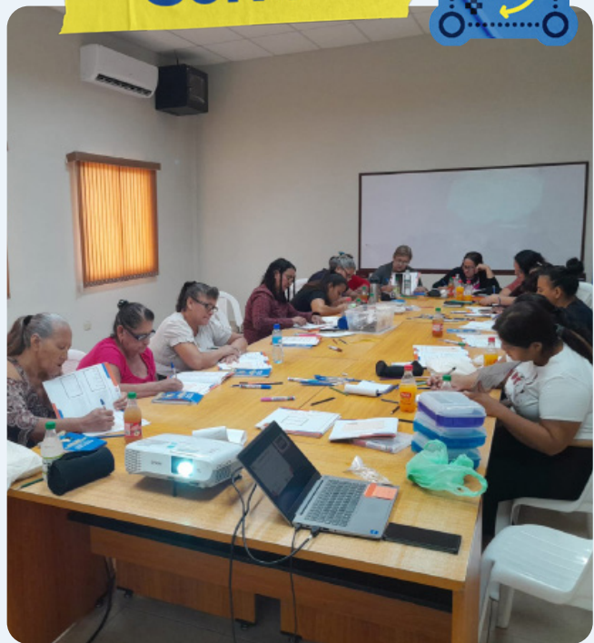
Participants of the Súper Pilas programme in Metapán, Santa Ana engage in sessions to develop life plans.

The fourth cohort in 2024 of Súper Pilas began with 165 participants, including 60 women referred by the national institution on women ISDEMU and funded by the MIRPS support platform. So far in 2024, UNHCR has provided capacity-building for self-employment and entrepreneurship for 261 people and aims to provide at least 100 participants with seed capital by year-end, supporting entrepreneurial projects that promote self-reliance.