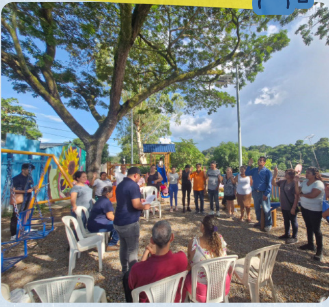
People in La Campanera community voting to elect their community board.