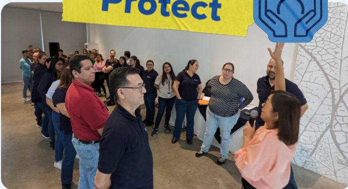
Staff members from GAMI engaging in group dynamics during a training on emotional intelligence.

Thirty-five staff members working at the returnee reception centre GAMI, enhanced their knowledge of emotional intelligence and psychological first aid through a workshop facilitated by UNHCR and World Vision. Participants from the General Directorate for Migration and Foreigners (DGME), the Directorate for the Attention of Victims (DAV), the National Council for Childhood and Adolescence (CONAPINA), and the Salvadoran Institute for Women's Development, learned about referral pathway and services available for people with specific needs.