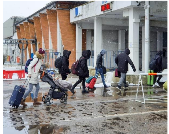
Ukrainian refugees crossing the Siret border to Romania on 2 March 2022.

This week, we are approaching a critical landmark of 1,000 days since the full-scale invasion of Ukraine commenced on 24 February 2022. Since then, 175,331 refugees who were forced to flee their homes in Ukraine obtained temporary protection in Romania seeking safety from the war. Millions more transited through the country benefitting from assistance, transport, shelter, and services. During these 1,000 days, under the leadership of Romanian authorities at the local and national levels, the humanitarian response has undergone a remarkable evolution – from emergency assistance to a mid-long-term response. Over the last 1,000 days, the refugee response in Romania has been sustained by many, including NGOs, donors, the private sector, and Romanian citizens, that together provided hope to refugees and those in need. UNHCR, in consultation with authorities, partners and refugees, is now finalizing the comprehensive planning for 2025, with a view to enhancing the inclusion of refugees in Romania and supporting the Romanian host communities.