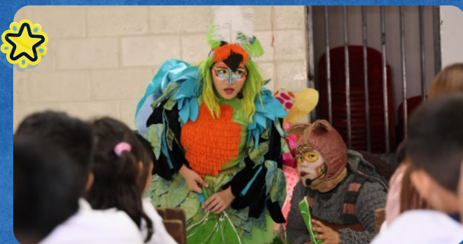
Children from the Tutunichapa community in San Salvador participating during the play "La Travesía de Gualcho".