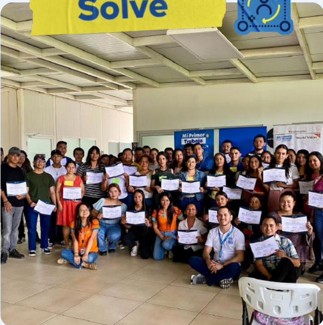
Participants of the My First Job Programme from various departments during skills training sessions for employability.

Under the Graffitiour initiative, led by the Directorate for the Reconstruction of Social Cohesion with support from UNHCR in Mejicanos, San Salvador, 11 participants from the Súper Pilas livelihoods programme presented their business ideas for evaluation. Through its support for Graffitiour and local entrepreneurs, UNHCR aims to revamp spaces in communities historically affected by forced displacement.