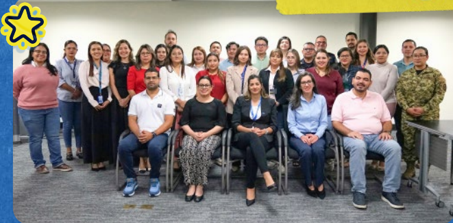
Participants of the diploma on International Protection during the inaugural session in the Diplomatic Institute.