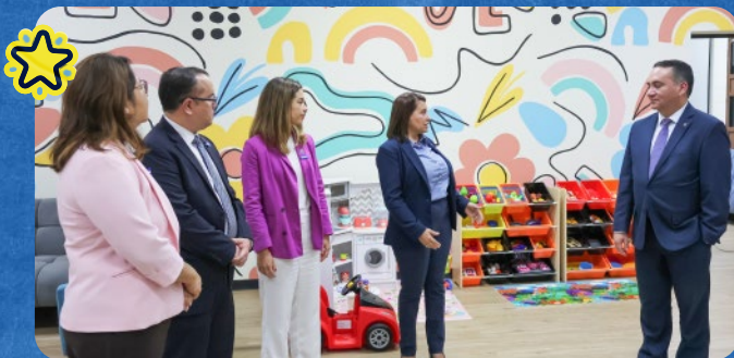
UNHCR's Representative a.i. along the General Prosecutor during the inauguration of a new space for attention to victims in La Libertad.