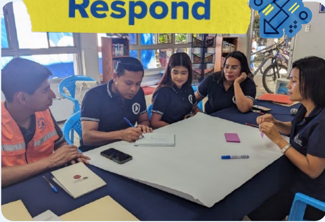
Shelter coordinators from across the country during the inaugural session of a UNHCR-supported training programme on shelter management and protection.

As co-lead of the CCCM Sector, UNHCR along the National Sectoral Technical Shelter Commission kickstarted training for municipal and national emergency shelter coordinators nationwide. Scheduled until November, the sessions aim at further embedding protection considerations in the coordination and management of temporary shelters. In October, 94 shelter coordinators from San Miguel, Morazán, Usulután, and La Unión participated in two workshops.