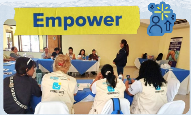
UNHCR's outreach volunteers from various regions learned on older people's right through workshops by PDDH in Sonsonate.

In Sonsonate, 62 UNHCR outreach volunteers attended a workshop led by the Ombudsperson's Office (PDDH) to deepen their understanding of older people's rights and protection mechanisms. The session covered types of violence and the Special Law for the Protection and Rights of Older People.