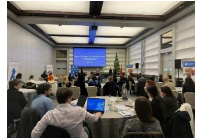
RefData Meet Up event in Bucharest