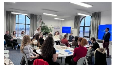
Refugee-led organization workshop

On 9 December, UNHCR conducted a workshop with refugee-led organizations (RLOs) and community-based organizations (CBOs) within the framework of UNHCR Grant Agreements for 2024. The UNHCR Representative thanked the RLOs and CBO for partnering with UNHCR and encouraged to continue joint efforts to support refugees. The event reflected on the achievements and challenges of 2024 projects and discussed the way forward for 2025. Seven RLOs and one CBO from locations such as Suceava, Arad, Medias, Sibiu, Galati, and Bucharest participated. The workshop focused on lessons learned from the past year, with sessions designed to share insights, identify capacity-building needs, and foster collaboration. Participants also discussed strategies for future projects, including advocacy, information sharing, and improving outreach efforts.