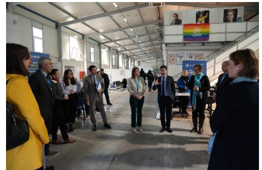
10 December, donor briefing at RomExpo, Bucharest.

On 10 December, UNHCR organized a briefing session for representatives of donor countries at UNHCR's Community Centre at RomExpo in Bucharest. During the briefing, UNHCR informed participants from different embassies about UNHCR's activities in 2024 and the plans of the organisation for 2025. In addition, UNHCR highlighted the Government's leading role, and UNHCR's coordination within the Refugee Response Plan and the crucial role of refugee-led organisations and host communities. Three organisations led by refugees from Ukraine, namely ACUM from Sibiu, EDNAE from Suceava and Malva from Bucharest, briefed participants on their activities and attended the briefing as well.