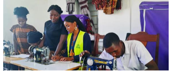
Refugees participate in sewing classes at a vocational skills centre in Nampula, Mozambique.

Context: As of September 2024, Southern Africa was home to 8.6 million forcibly displaced people and returnees . The region comprises one of the largest IDP situations in sub-Saharan Africa, while refugee camps and settlements in multiple countries, along with some urban areas, host long-term refugee populations – some displaced for many decades. Complex crises cause millions to flee their homes and prevent their safe return every year. The situation is further complicated by the growing impact of climate change and natural disasters , which have displaced 1 million people in Southern Africa.