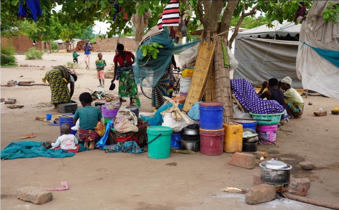
Recent arrivals at a collective centre in Nsanje District of Malawi. Due to overcrowding, many people are sheltering in open areas.