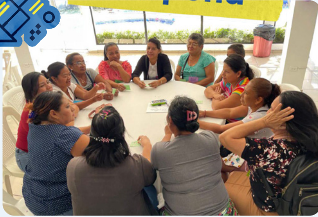
Women from various regions engage in a dialogue to share challenges and solutions for their communities.