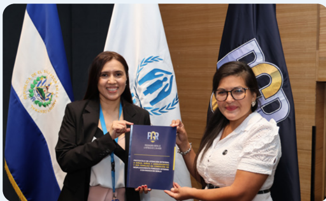
PGR staff during training sessions on the new protocol for the protection of displaced children developed with UNHCR support.