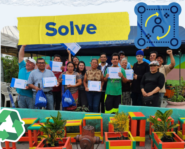
Residents of La Campanera community showcase the recycled fiberglass products they created through UNHCR-supported training.