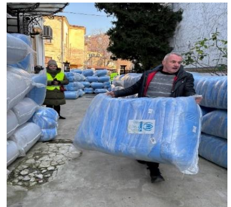
CRI distribution at Independent Midwives Association. January 2025.

UNHCR provides humanitarian support to refugees by distributing core relief items (CRIs) to address their most urgent basic needs. Last week, UNHCR, in collaboration with partners, distributed CRIs including clothes, blankets and hygiene kits in Brasov, Galati, Bucharest and Iasi. Since the start of 2025, UNHCR has distributed over 6,900 CRIs to some 4,200 refugees.