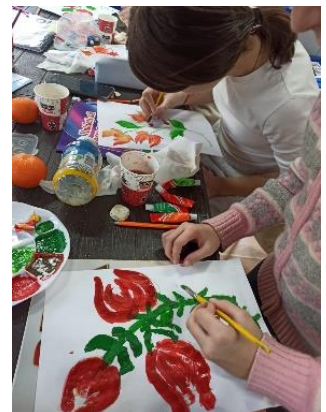
Painting workshop, February 2025.

On 4 February, UNHCR and partner World Vision organized a painting workshop in Bucharest, led by a talented Ukrainian artist, with children participating. The workshop, that is part of a mental health and psychosocial support program, provided a safe space for children to explore their emotions through creative expression. The session aimed to promote emotional well-being by helping children process their feelings, reduce stress, and foster social connections with their peers. Through the act of painting, the children were able to express their experiences, build resilience, and feel supported within a community, highlighting the importance of creative outlets in healing and mental health recovery.