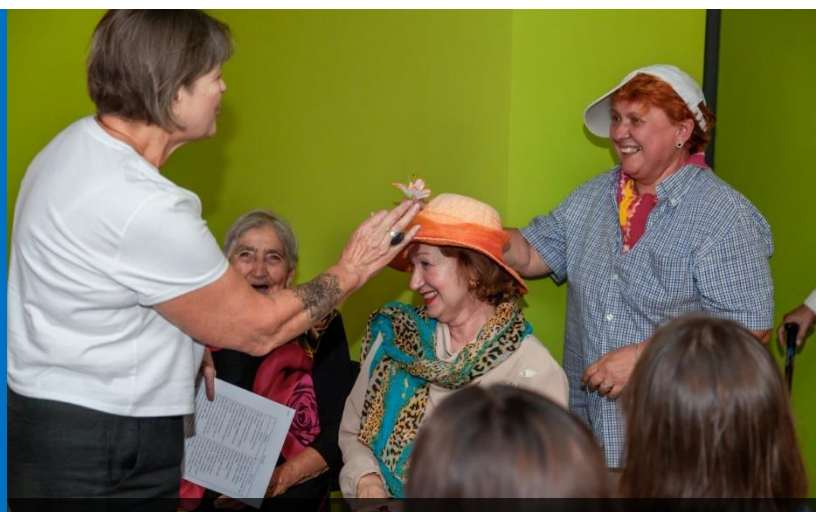
UNHCR-supported community-based organization 'Age of Happiness' assists older people through social and psycho-social support activities and learning opportunities, such as for digital literacy, thereby enhancing their wellbeing and integration.