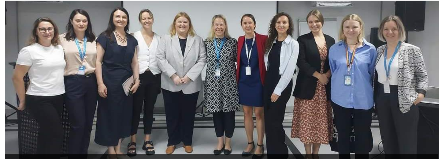
Convening stakeholders to discuss the strategy and support action for the evacuation and relocation of older people and people with disabilities in frontline areas – a joint initiative by the Ministry of Social Policy, the Presidential Commissioner for a Barrier-Free Environment, Protection Cluster, and UNHCR, supported by WHO and UNICEF experts.

In 2024, UNHCR continued to work with key entities of the national civil society , including IDP Councils, communitybased organizations and other community initiatives and volunteers, who show every day that community-led action matters in the lives of displaced people and the communities they live in. In 2025, we will continue to strengthen these community-based protection systems by leveraging and supporting the role and capacity of national civil society so they continue to extend social support, enhance resilience and self-reliance capacities, strengthen social cohesion and improve access to rights and services - thereby contributing to a national system that protects.