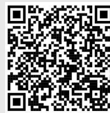
SCAN HERE for Counter-trafficking Working Group available information and data