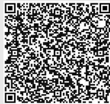
SCAN HERE for Socio-Economic Insight Survey 2024 - Dashboard