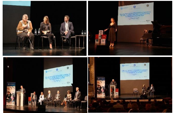
Photos of the event to mark three-years of the refugee response in Romania. 21 February 2025, Bucharest

On 21 February, the Inter-Agency Coordination platform in Romania - led by UNHCR- together with the Chancellery of the Prime Minister and the Department for Emergency Situations (DSU), marked three-years of the refugee response in Romania and launched the 2025-2026 Refugee Response Plan (RRP) in an event at the Odeon Theatre in Bucharest. Over one hundred attendees including from the Presidential Administration, Government authorities, Diplomatic Corps and RRP partners participated at the event. Through the RRP, 42 partners (31 national NGOs, six INGOs and five UN Agencies) are seeking USD 155 million for their activities to support refugees from Ukraine in Romania in 2025 and 2026.