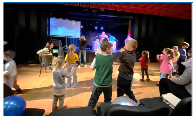
Ukrainian refugee children participating in a puppet theatre performance in Bratislava in December 2024.

UNHCR expanded the DAFI Scholarship program in Slovakia, increasing support from 31 to 40 refugee students, including 38 Ukrainian students, for the academic year 2024/25. In addition to the scholarships, the initiative provides cash grants to help students meet basic needs, focusing on promoting social inclusion and economic stability. UNHCR cooperates with Slovak universities and focuses on facilitating students' access to employment, internships and volunteering opportunities, engaging private employers to leverage refugee potential. The program's success was highlighted by Yurii, the first DAFI scholar to graduate from a Slovak university .