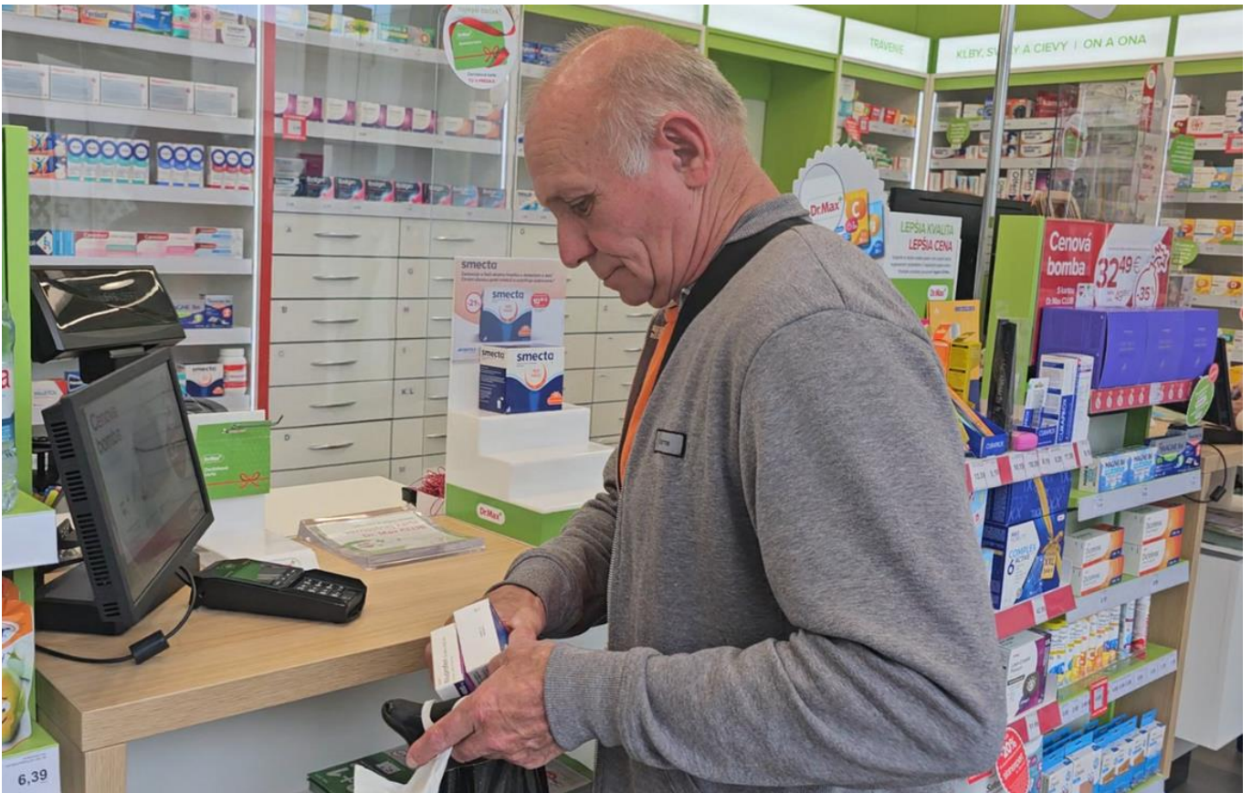
A Ukrainian refugee purchases essential medication at a local pharmacy, utilizing the cash assistance provided through Cash for Protection program.

On 16 May 2024, UNHCR and UNICEF, launched a new joint cash assistance program aimed at supporting refugees with vulnerabilities in Slovakia with the aim to continue complementing the ongoing government-led efforts and to cover gaps in social protection systems. This initiative targeted refugees, Temporary Protection holders (“odidenc”), asylum-seekers, and stateless persons in Slovakia, who met a specific eligibility criteria to be considered particularly vulnerable. The objectives of the cash assistance were: