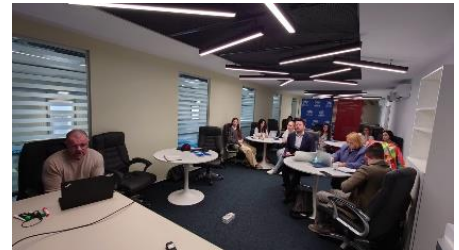
LEI meeting at RomExpo Community Centre, Bucharest, 16 April 2025.

On 16 April, UNHCR, in collaboration with its partner World Vision, held the monthly Livelihoods and Economic Inclusion (LEI) working group meeting in a hybrid format, bringing together 31 participants—12 in person at RomExpo Community Centre and 19 online. The meeting focused on strengthening existing collaboration among public, private and NGO sectors to enhance economic inclusion opportunities for refugees in Romania. Highlights included presentations from the RDCC and Jobs4Ukraine, updates on UNHCR's regional Refugee Employment Platform and insights from refugee entrepreneurs who shared challenges and successes in building businesses locally.