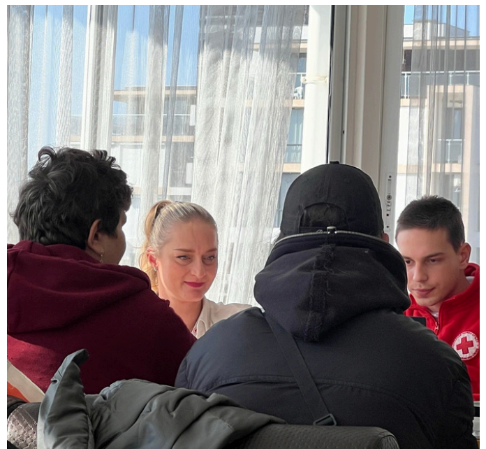
UNHCR's partner, the Bulgarian Red Cross, is conducting a verification mission in Sunny Beach, Burgas.

UNHCR is grateful for the support from our top government donors: Australia | Austria | Belgium | Canada | Denmark | European Union | France | Germany | Iceland | Ireland | Italy | Japan | Liechtenstein | Norway | Netherlands (Kingdom of the) | Republic of Korea | Spain | Sweden | Switzerland | United Kingdom of Great Britain and Northern Ireland | Private donors