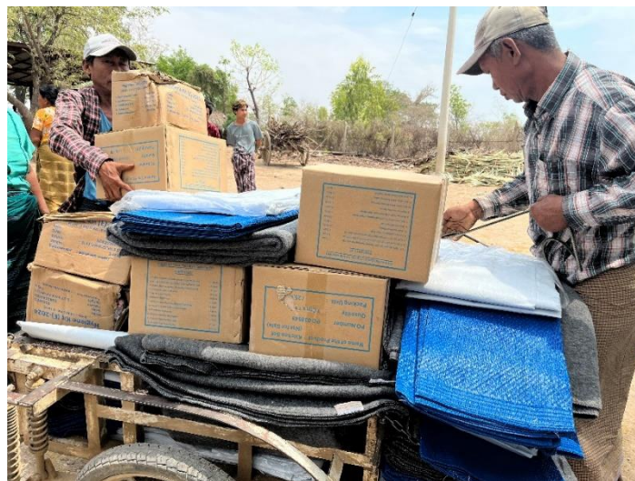
CRI distributions reaching vulnerable communities in urgent need

To learn more about UNHCR's response in Myanmar, please visit the Operational Data Portal and Global Focus Reporting .