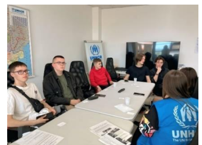
Meeting of Youth Club, Constanta, April 2025.

On 24 April, UNHCR established a Youth Club in Constanța. The club brought together nine boys aged from 14–18 years old from Ukraine, marking an important step in supporting refugee youth integration. The club provides a safe, engaging space for young people to connect with peers and the local community, easing their adaptation to life in Romania. Through shared activities, social interaction and peer support, the initiative fosters personal growth, confidence and meaningful friendships.