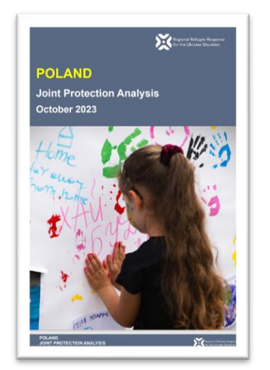
Poland joint protection analysis October 2023