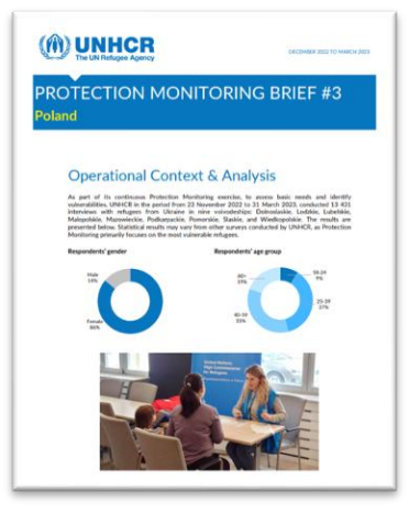
#3 (23 November - 31 March 2023)