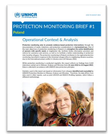
#1 (June to August 2022)