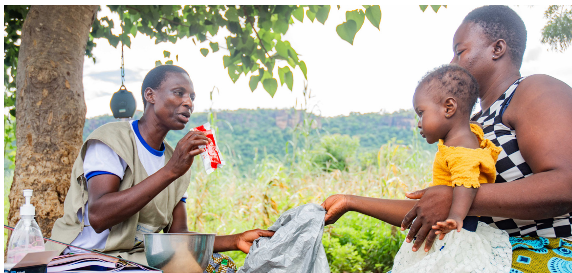
Community management of acute malnutrition - Bomboaka (Togo)

In the prefectures of Tône, Kpendjal, Kpendjal-West, and Cinkassé, 41 ACEC/AVECs, with more than 500 members, have been supported in collaboration with national partners and actors of the Joint Response Plan (Women's Network for Development/REFED, National Youth Council/CNJ, National Employment Promotion Agency/ANPE, Women's Club of the Savanes for the Promotion of Culture).