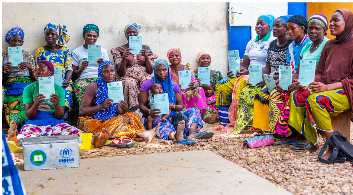
Refugee and host community women in a savings and credit association - Korbonghou, (Togo)

The cross-cutting nature of social cohesion. In 2024, the partners of the Joint Response Plan placed particular emphasis on the cross-cutting integration of social cohesion issues throughout their interventions related to forced displacement. The main interventions included: a) the establishment of 20 mixed Community Savings and Credit Associations with 15 refugee and 10 host community members, which enabled joint gardening activities; b) strengthening capacities and traditional dialogue mechanisms by relying on religious and community leaders; and c) awareness campaigns on the issue of violent extremism and the role of communities in prevention. Access to basic social services and food distribution (see below, Strengthening Emergency Response) also contributed to enhancing social cohesion by strengthening ties between communities through an inclusive approach that integrates refugees, IDPs, and host populations. By addressing essential needs in an equitable manner, access to key needs such as water, health, and education, as well as distributions, promoted resource sharing and reduced tensions related to competition for access to water, food, opportunities, and natural resources.