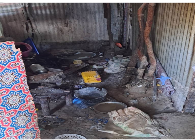
Left Flood-submerged shelter of an IDP family. Right: A shelter in Garasbaaley IDP camp severely affected by flooding.

Disclaimer: This alert serves as a call for urgent and coordinated humanitarian response. For that purpose, preliminary information is reported outlining immediate priority needs. Assessments of the situation are ongoing and updates will be shared as further information becomes available.