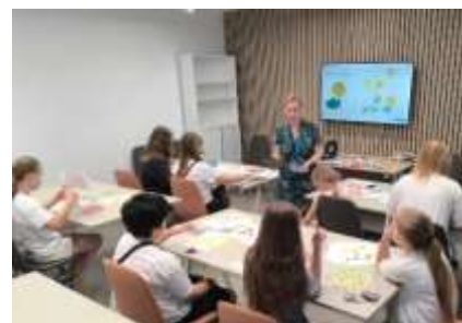
On 5 June, refugee children attend a workshop organised by UNHCR as part of events marking International Children's Day at the UNHCR RomExpo Community Centre.

On 5 June, UNHCR held two workshops for refugee children at the UNHCR RomExpo Community Centre in Bucharest to commemorate International Children's Day. An origami workshop offered a creative and engaging way for children to learn about their rights and explore themes related to their growth and wellbeing. The activity provided a safe space for self-expression, introducing key rights such as the right to education. The second workshop encouraged the children to speak about the concept of gender, gender equality, the importance of preventing gender-based violence (GBV) while mastering their skills in English. By combining hands-on creativity with meaningful discussion, both workshops supported children's emotional well-being, encouraged self-confidence, and strengthened their understanding of how their rights can be practiced in everyday life.