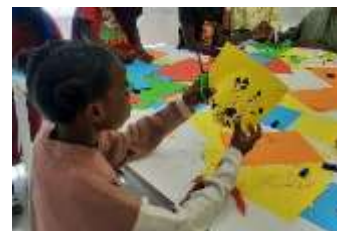
A refugee child at the ETC in Timișoara prepares to mark World Refugee Day.

During the past week, refugees hosted at the Emergency Transit Centre (ETC) in Timișoara took part in a creative workshop in preparation for World Refugee Day on 20 June. The event brought together 15 refugee adults and children from Afghanistan and Sudan refugees to create a symbol of strength and hope in the form of a group art piece making handprints on large canvas as a statement of solidarity. The theme of this year's World Refugee Day is "Solidarity with Refugees". So far in 2025, the ETC provided assistance to some 200 refugees and helped more than 4,350 refugees since opening in 2008.